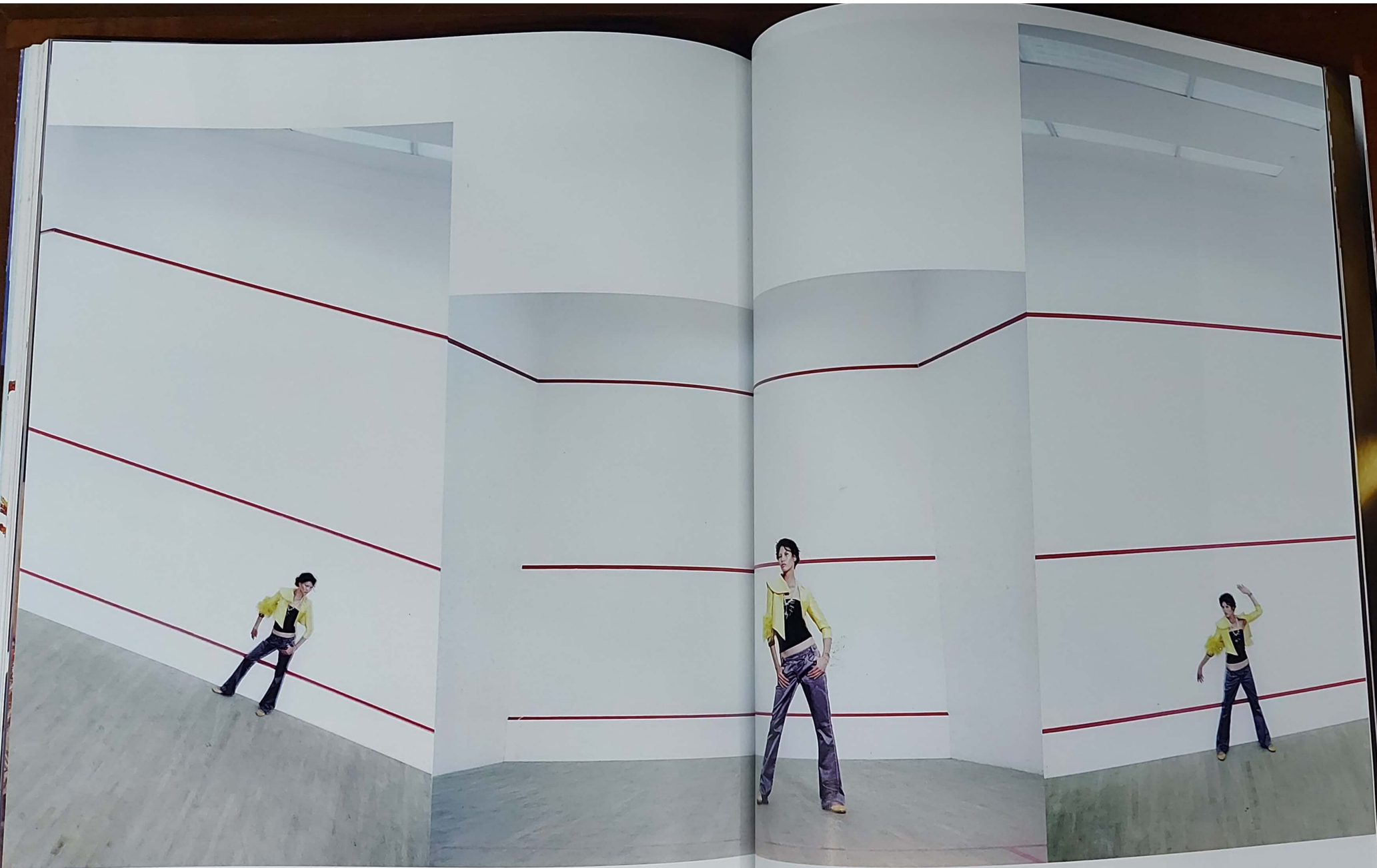
Yellow Thai silk cropped jacket with ostrich and rooster feather cuff by Mel Vergel de Dios, transparent Manhattan Murano necklaces by Sent Jewelry, denim jeans with metallic wash (P4500) by Bebe at Souk, yellow beaded Kussa slippers (P2500) by Genn Ang