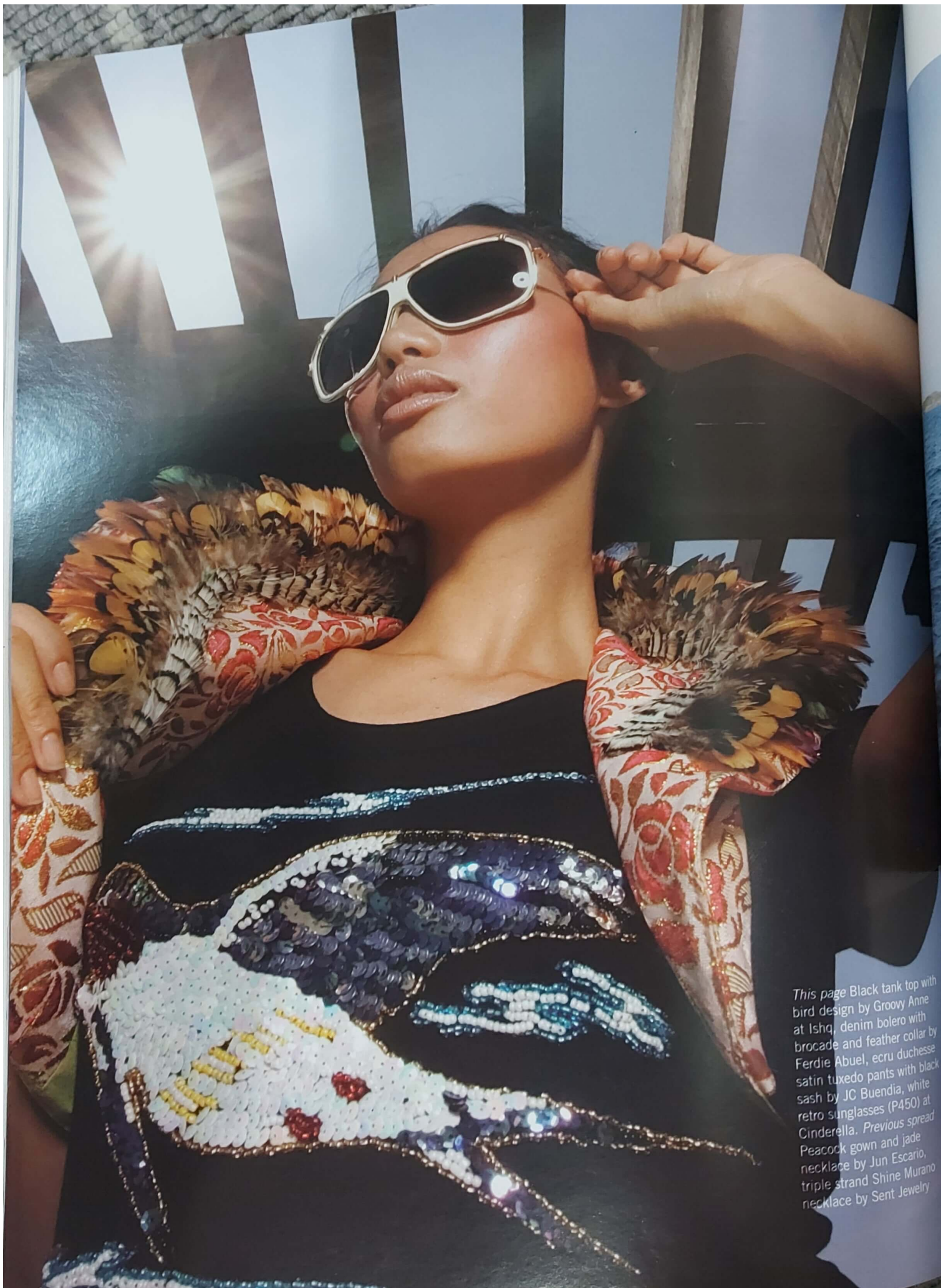
This page Black tank top with bird design by Groovy Anne at Ishq, denim bolero with brocade and feather collar by Ferdie Abuel, ecru duchesse satin tuxedo pants with black sash by JC Buendia, white retro sunglasses (P450) at Cinderella. Previous spread Peacock gown and jade necklace by Jun Escario, triple strand Shine Murano necklace by Sent Jewelry