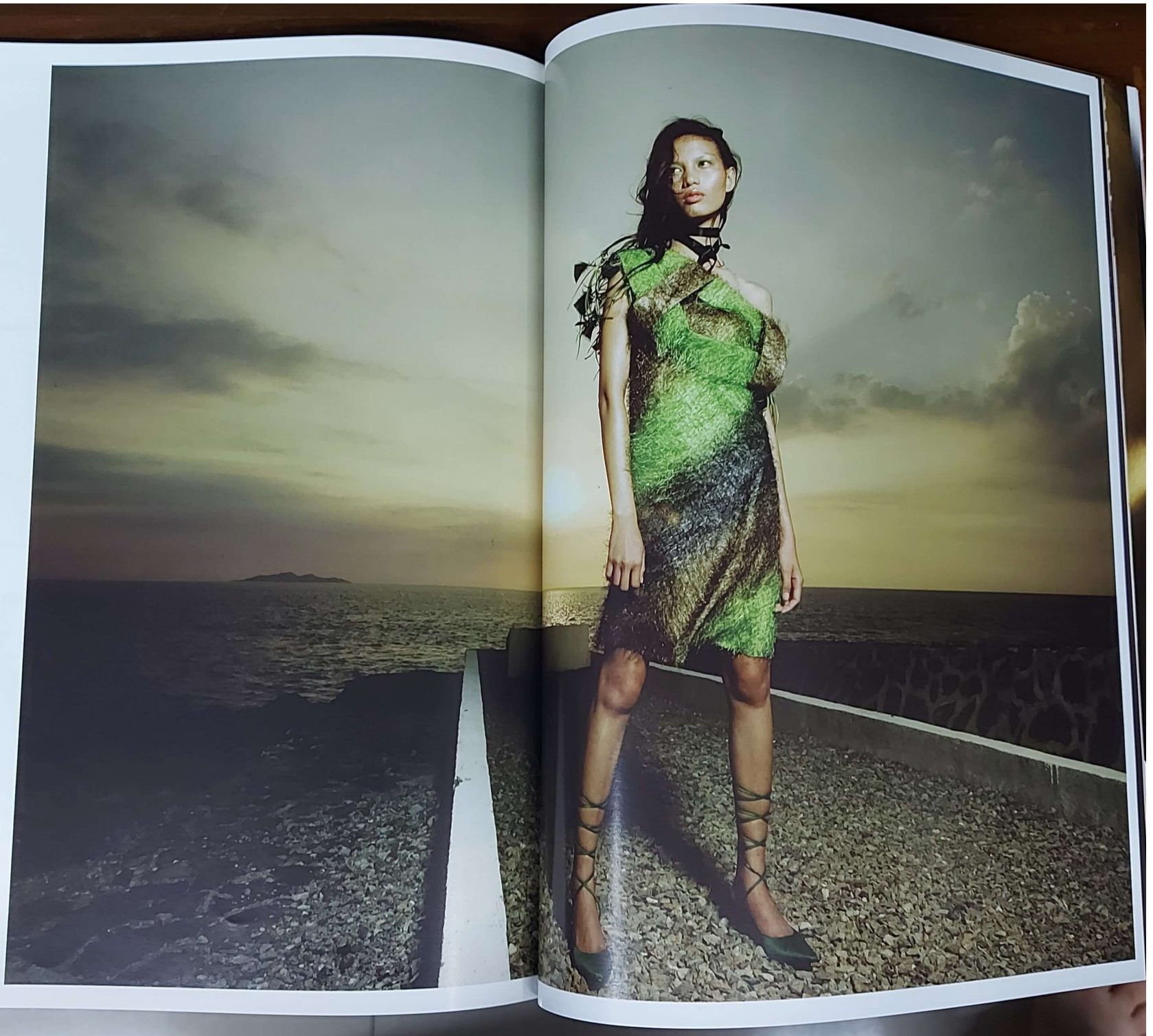
Green and black sheath with dyed rooster feathers by Mel Vergel de Dios, green tie strap pumps by Lila Almario